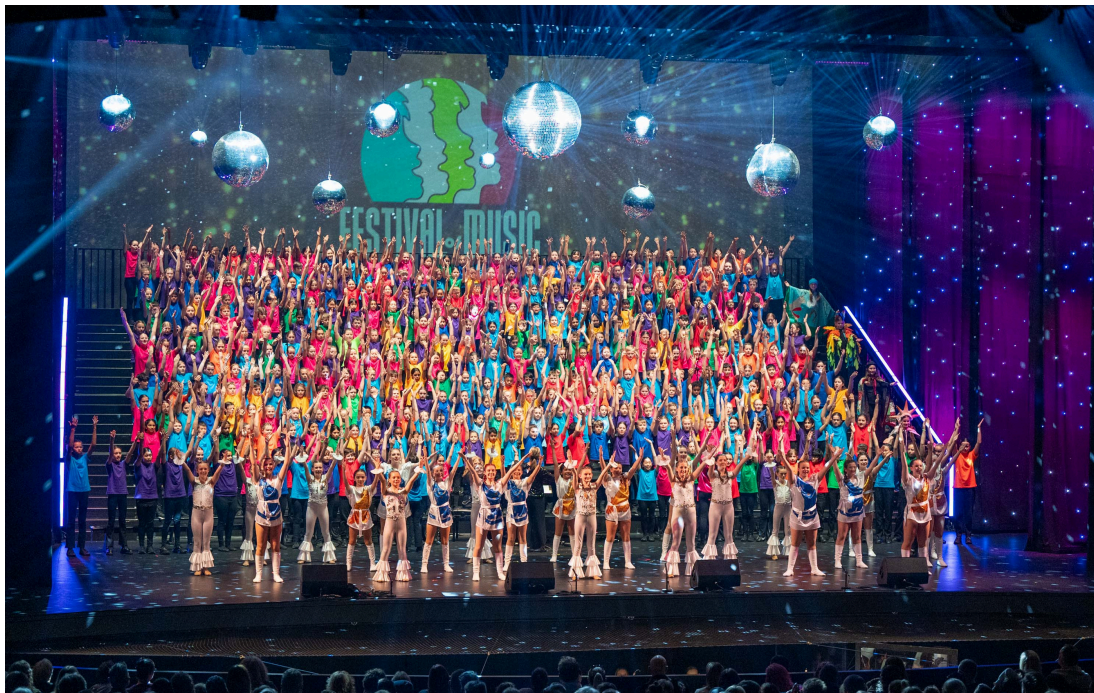
Finale – Thank You for the Music