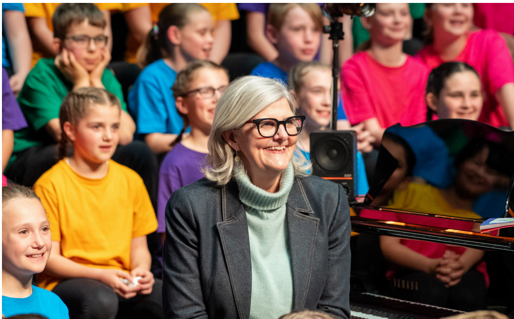
Her excellency Ms Sam Mostyn, Governor-General Australia